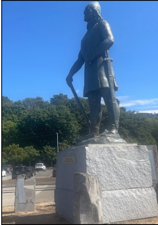
Leif Erickson